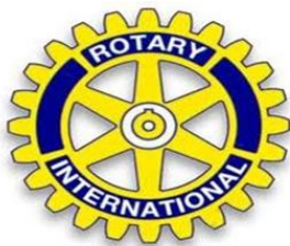
Rotary Club of Dubbo